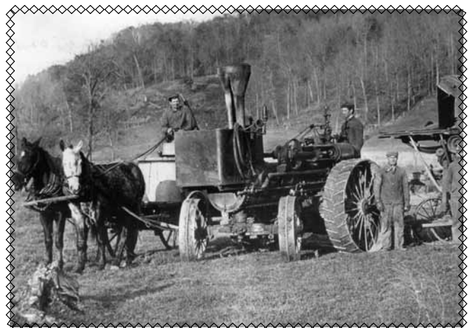
L - Rockton Coronet Band, around 1900 R - Obert threshing machine